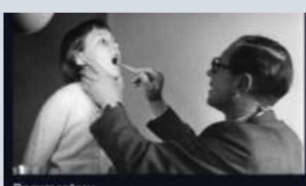
entary On Call to a Nation