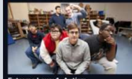
Extreme Love: 1. Autism