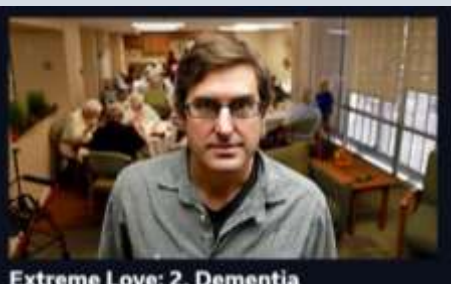
Extreme Love: 2. Dementia