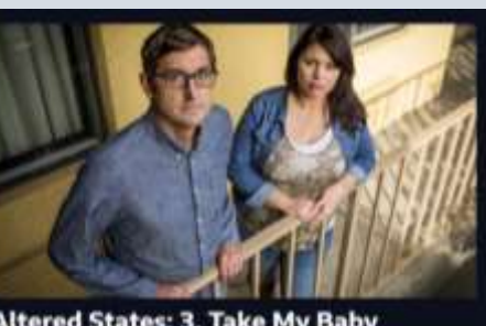
Altered States: 3. Take My Baby