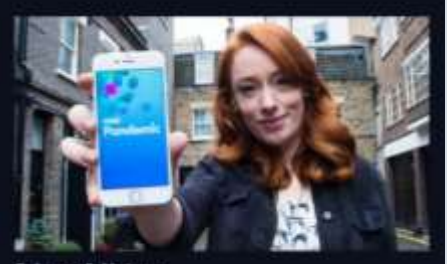
ce & Nature Contagion: The BBC Four Pandemic