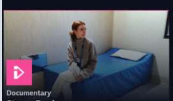
Stacey Dooley Stacey experiences the pressure of life on the frontline of mental health services.